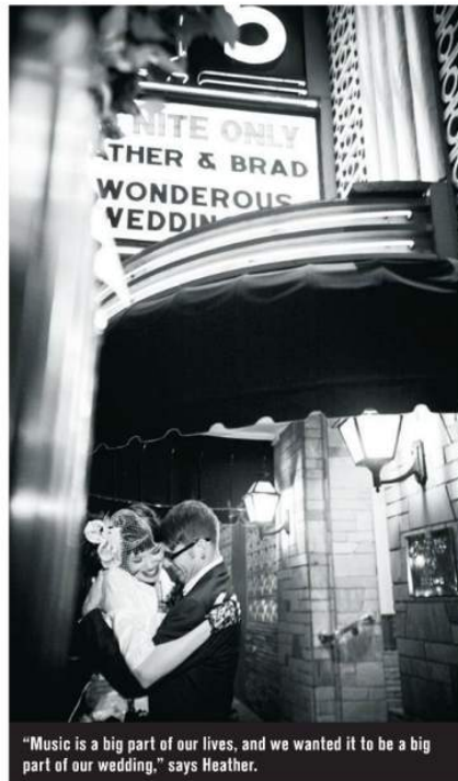
"Music is a big part of our lives, and we wanted it to be a big part of our wedding," says Heather.