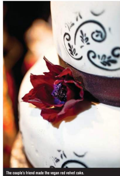
The couple's friend made the vegan red velvet cake.