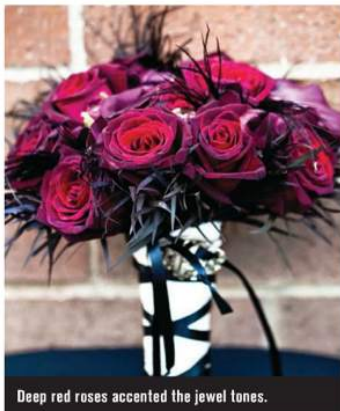
Deep red roses accented the jewel tones.