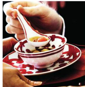
Chinese and Indonesian delicacies headlined the menu.