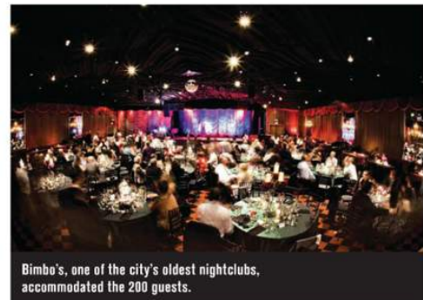
Bimbo's, one of the city's oldest nightclubs, accommodated the 200 guests.