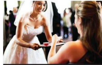
The families bonded during the tea ceremony.