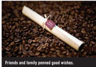
Friends and family penned good wishes.