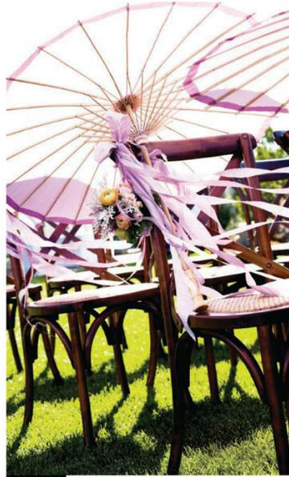
Lilac umbrellas shaded guests from the Napa sun.