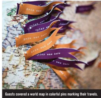
Guests covered a world map in colorful pins marking their travels.