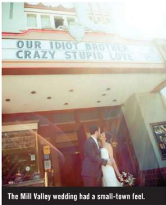
The Mill Valley wedding had a small-town feel.