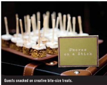
Guests snacked on creative bite-size treats.