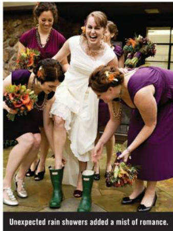
Unexpected rain showers added a mist of romance.