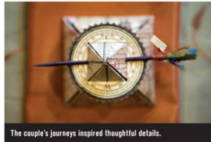
The couple's journeys inspired thoughtful details.