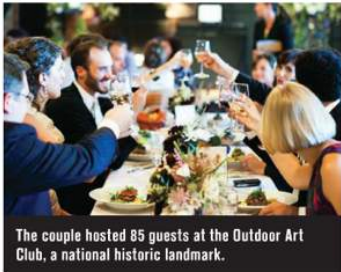
The couple hosted 85 guests at the Outdoor Art Club, a national historic landmark.