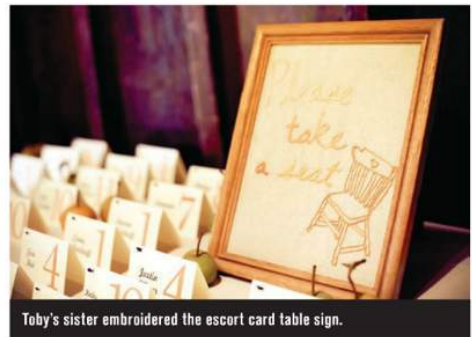
Toby's sister embroidered the escort card table sign.