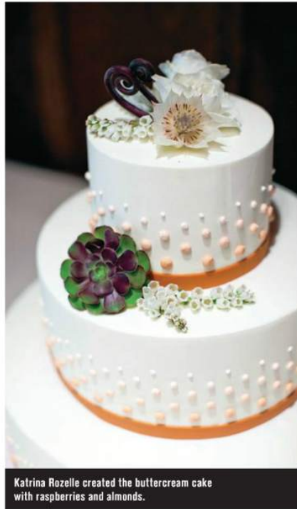
Katrina Rozelle created the buttercream cake with raspberries and almonds.