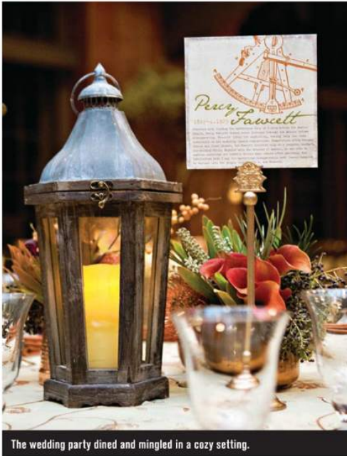
The wedding party dined and mingled in a cozy setting.