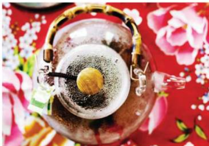
Vibrant red details symbolized good fortune.